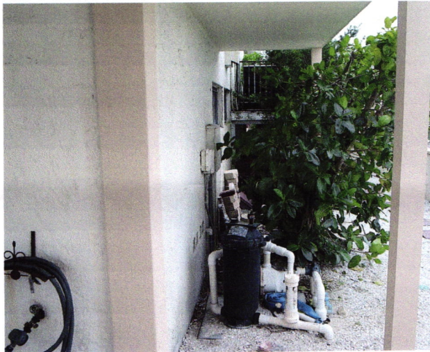
LEFT SIDE VIEW 2/27/15