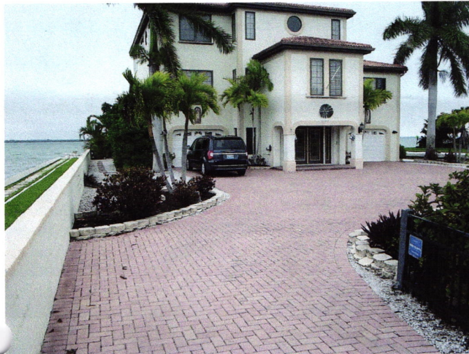
FRONT VIEW 2/27/15