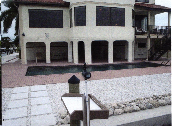
REAR VIEW 2/27/15