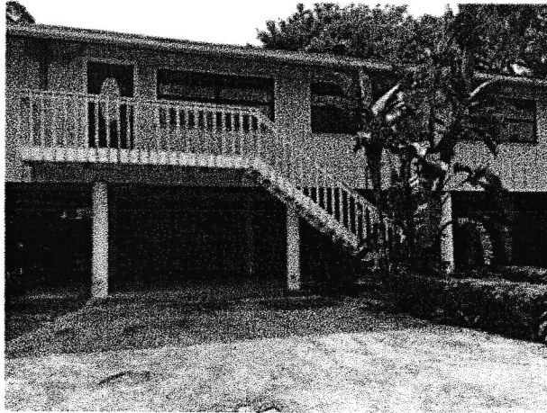
Front of House (4/16/16)

If using the Elevation Certificate to obtain NFIP flood insurance, affix at least 2 building photographs below according to the instructions for Item A6. Identify all photographs with date taken; "Front view" and "Rear view"; and, if required, "Right Side View" and "Left Side View." When applicable, photographs must show the foundation with representative examples of the flood openings or vents, as indicated in Section A8. If submitting more photographs than will fit on this page, use the Continuation Page.