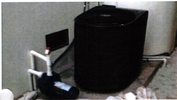
SMART VENT SOUTH SIDE GARAGE (1):