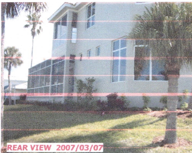
05-04-39-C RICHIE 3-7-07.JPG