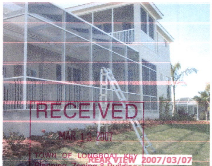
05-04-39-D RICHIE 3-7-07.JPG