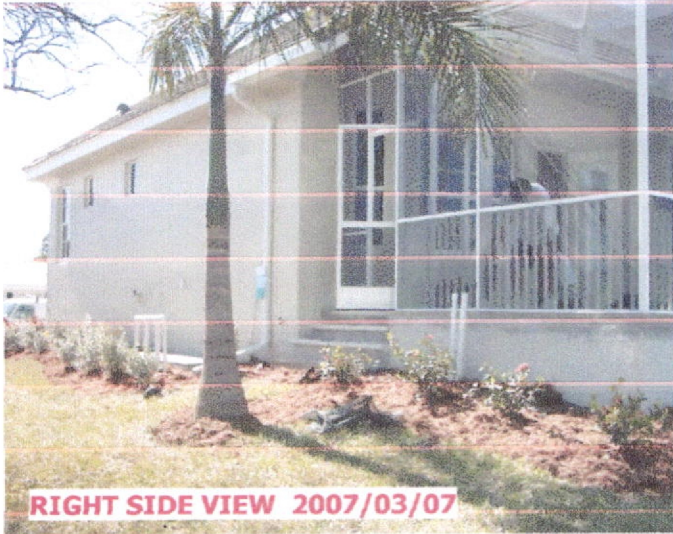
RIGHT SIDE VIEW 2007/03/07