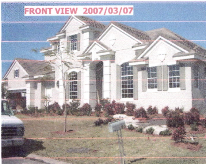
05-04-39-A RICHIE 3-7-07.JPG

If using the Elevation Certificate to obtain NFIP flood insurance, affix at least two building photographs below according to the instructions for Item A6. Identify all photographs with: date taken; "Front View" and "Rear View"; and, if required, "Right Side View" and "Left Side View." If submitting more photographs than will fit on this page, use the Continuation Page, following.