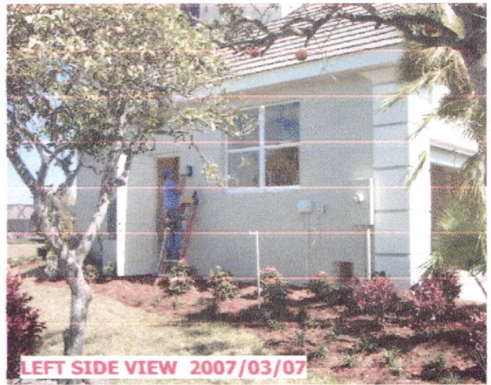
05-04-39-B RICHIE 3-7-07.JPG