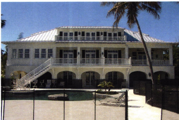
2-19-2007 - RIGHT