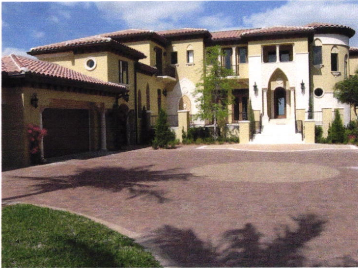
Front View 03/29/07

If using the Elevation Certificate to obtain NFIP flood insurance, affix at least two building photographs below according to the instructions for Item A6. Identify all photographs with: date taken; "Front View" and "Rear View"; and, if required, "Right Side View" and "Left Side View." If submitting more photographs than will fit on this page, use the Continuation Page, following.