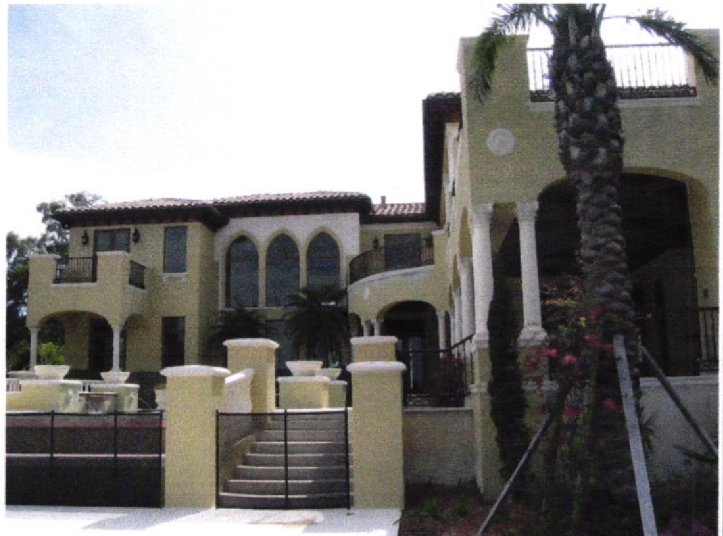
Rear View 03/29/07

RECEIVED APR 13 2007 TOWN OF LONGBOAT KEY Planning, Zoning & Building