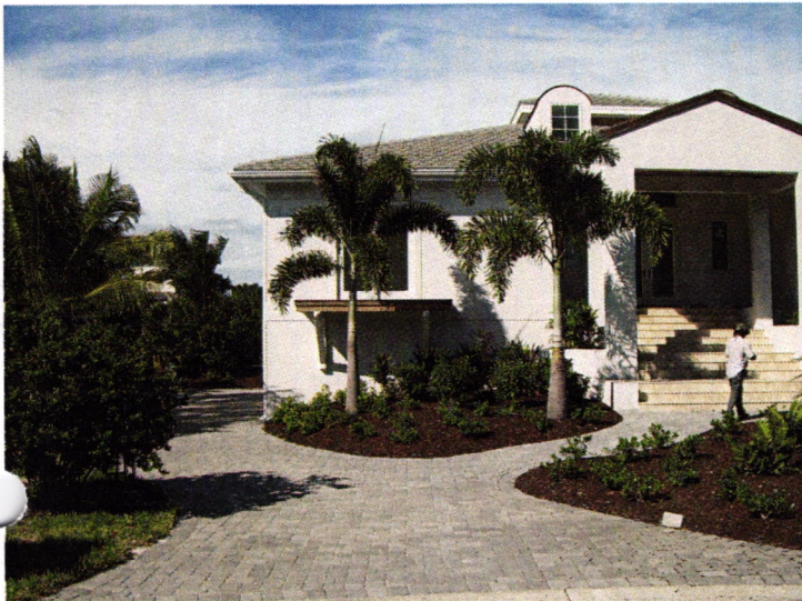
Front Elevation Photo dated 10/26/07

If using the Elevation Certificate to obtain NFIP flood insurance, affix at least two building photographs below according to the instructions for Item A6. Identify all photographs with: date taken; "Front View" and "Rear View"; and, if required, "Right Side View" and "Left Side View." If submitting more photographs than will fit on this page, use the Continuation Page, following.