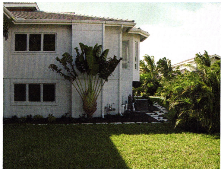
Right Rear & Side Elevation Photo dated 10/26/07

RECEIVED SEP 17 2008 TOWN OF LONGBOAT KEY Planning, Zoning & Building