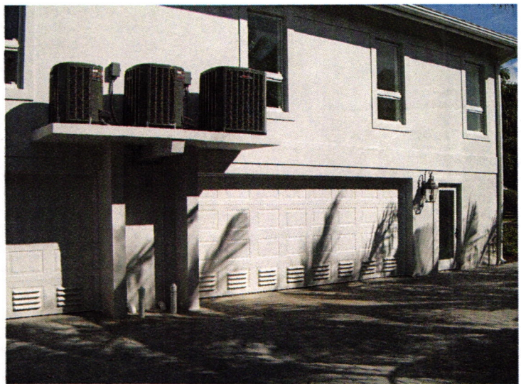
Garage Side Elevation Photo dated 10/26/07